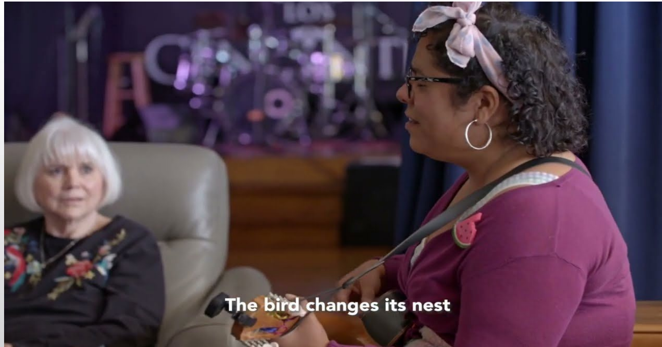
The bird changes its nest