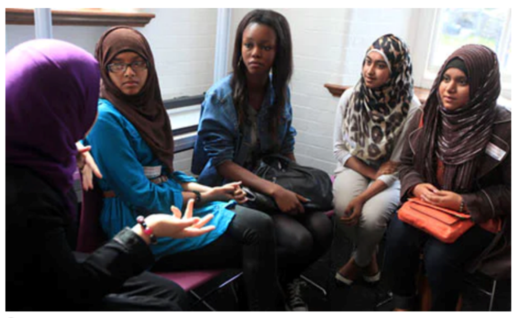
We've created some feminists!... A study group on the Demand the Impossible course at Goldsmith's.