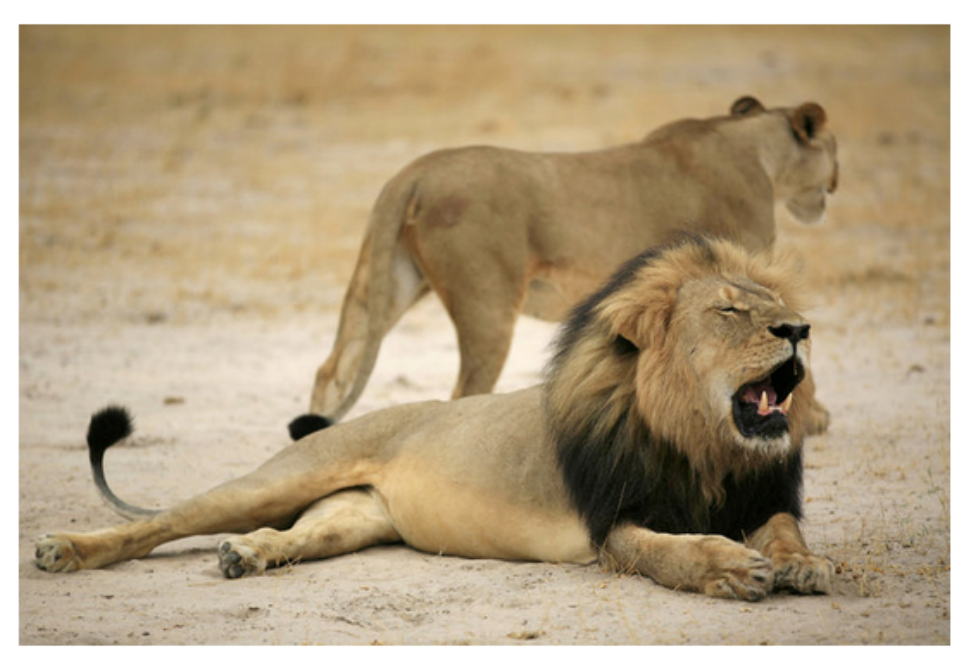
Cecil was well known in Hwange National Park in Zimbabwe.